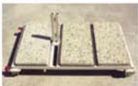
MOBILE STAND Transportable Base on castors