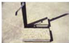
H-STAND Transportable Base