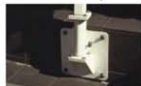
WALL MOUNTED BASE Inc. Revolving. For low wall mounting