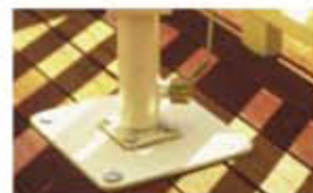
BOLT DOWN BASE Inc. Revolving On concrete slab or timber deck

Tropicover Outdoor LifeStyle Umbrellas are designed to be used in every situation, they can be bolted to concrete or timber deck, sunk into the ground, and optionally you can place the umbrella on a mobile with castors and brakes base. A simple winder handle with an internal winch mechanism and child safety system enables the umbrella to be fully opened until the Dual-Canopy is taut and can be closed easily, it folds into a compact vertical format and can be easily lifted from the base and stored away; to protect your umbrella when not in use a special Wrap-Bag is available as an option.