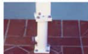
INGROUND BASE Inc. Revolving Into concrete for Grass, Clay or Soil